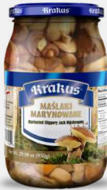
SLIPPERY JACK MUSHROOMS MAŚLANKA MARYNOWANE 29.98 oz | 850 g | 6 units UPC# 820213131809