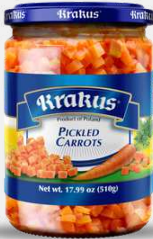
PICKLED CARROTS MARCHEWKA KONSERWOWA 17.99 oz | 510 g | 8 units UPC# 820213124641