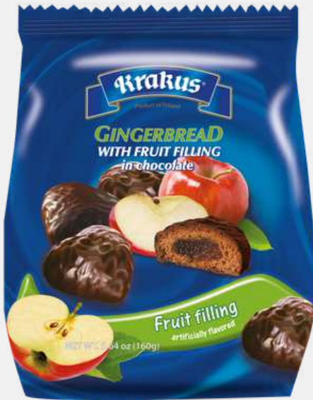
CHOCOLATE COVERED GINGERBREAD WITH FRUIT-FILLING PIERNICZKI OWOCOWE W CZEKOLADZIE 5.64 oz | 160 g | 12 units UPC# 820213129165