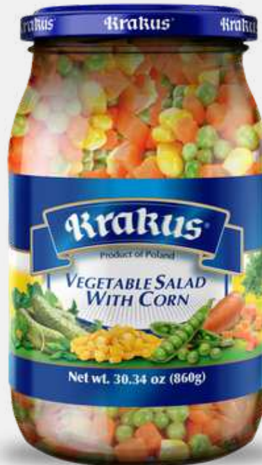
VEGETABLE SALAD WITH CORN SAŁATKA WARZYWNA Z KUKURYDZĄ 30.34 oz | 860 g | 6 units UPC# 820213124740