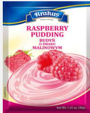
RASPBERRY PUDDING BUDYŃ O SMAKU MALINOWYM 1.41 oz l 40 g l 30 units UPC# 820213068846