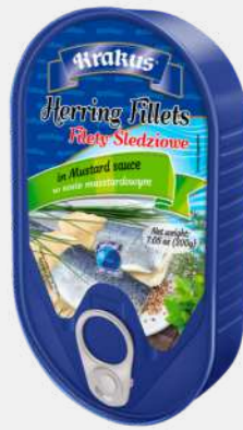
HERRING FILLETS IN MUSTARD SAUCE ŚLEDZI W SOSIE MUSZTARDOWYM 7.05 oz l 200 g l 10 units UPC# 820213133063