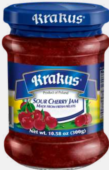
SOUR CHERRY JAM DŻEM WIŚNIOWY 10.58 oz l 300 g l 6 units UPC# 820213101857