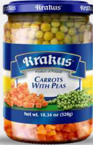
CARROTS WITH PEAS MARCHEWKA Z GROSZKIEM 18.34 oz | 520 g | 8 units UPC# 820213124702