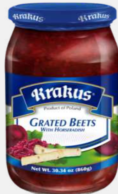
GRATED BEETS WITH HORSE RADISH ĆWIKŁA Z CHRZANEM 30.34 oz | 860 g | 12 units UPC# 820213144021