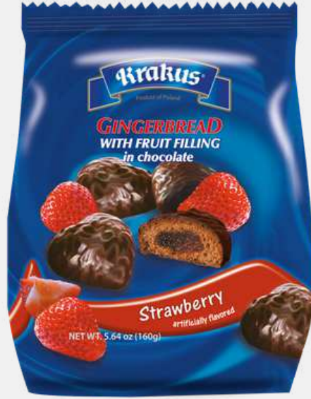
CHOCOLATE COVERED GINGERBREAD WITH STRAWBERRY-FILLING PIERNICZKI TRUSKAWKOWE W CZEKOLADZIE 5.64 oz | 160 g | 12 units UPC# 820213129004