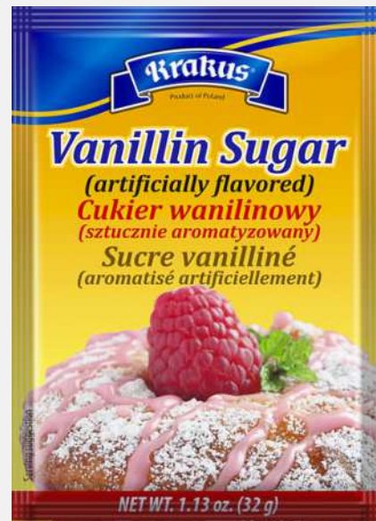
VANILLIN SUGAR CUKIER WANILINOWY 1.13 oz l 32 g l 35 units UPC# 820213068709