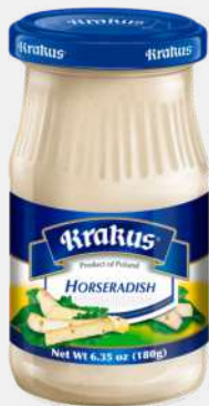
HORSERADISH CHRZAN 6.35 oz l 180 g l 12 units UPC# 820213101253