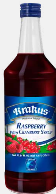
RASPBERRY & CRANBERRY SYRUP SYROP MALINA-ŻURAWINA 33.8 fl oz | 1 L | 6 units UPC# 820213123569