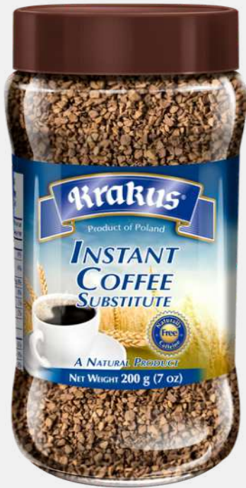
INSTANT COFFEE SUBSTITUTE JAR KAWA ZBOŻOWA - SŁOIK 7 oz l 200 g l 12 units UPC# 820213100225