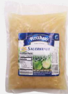
SAUERKRAUT (BAG) KAPUSTA KISZONA 31.99 oz | 907 g | 10 units UPC# 820213123408