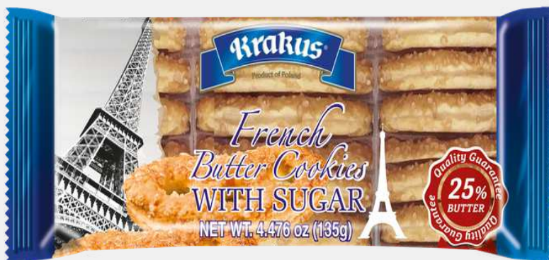
FRENCH BUTTER COOKIES WITH SUGAR PRECLE FRANCUSKIE Z MASŁEM I CUKREM 4.48 oz | 135 g | 14 units UPC# 820213130673