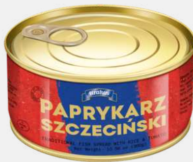
FISH SPREAD WITH RICE & TOMATO PAPRYKARZ SZCZECIŃSKI 10.58 oz l 300 g l 12 units UPC# 820213133322