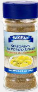
SEASONING FOR POTATO DISHES PRZYPRAWA DO ZIEMNIAKÓW 2.12 oz | 60 g | 6 units UPC# 820213136408