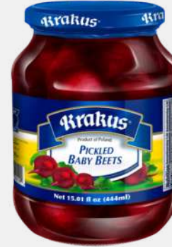
PICKLED BABY BEETS BURACZKI KONSERWOWE CAŁE 15.01 fl oz | 444 ml | 12 units UPC# 820213101192