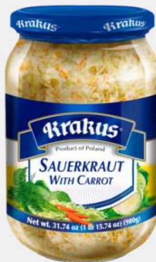
SAUERKRAUT WITH CARROT KAPUSTA KISZONA Z MARCHEWKA 31.74 oz | 900 g | 12 units UPC# 820213101413