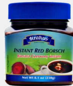
INSTANT RED BORSCHT BARSZCZ CZERWONY INSTANT 8.10 oz | 230 g | 6 units UPC# 820213136163