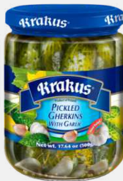
PICKLED GHERKINS WITH GARLIC OGÓRKI KORNISZONY Z CZOSNKIEM 17.64 oz | 500 g | 6 units UPC# 820213145080