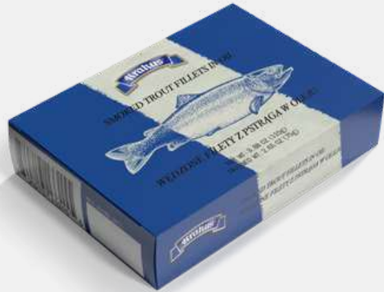
SMOKED TROUT FILLETS IN OIL WĘDZONE FILETY Z PSTRĄGA W OLEJU 3.88 oz l 110 g l 10 units UPC# 820213133155