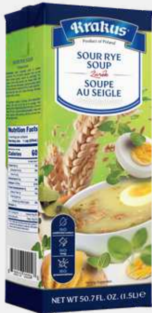
SOUR RYE SOUP ZUPA ŻUREK 50.7 fl oz | 1.5 L | 6 units UPC# 820213002048