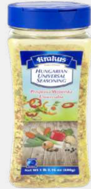
HUNGARIAN UNIVERSAL SEASONING PRZYPRAWA WĘGIERSKA UNIWERSALNA 5.16 oz | 600 g | 6 units UPC# 820213136002