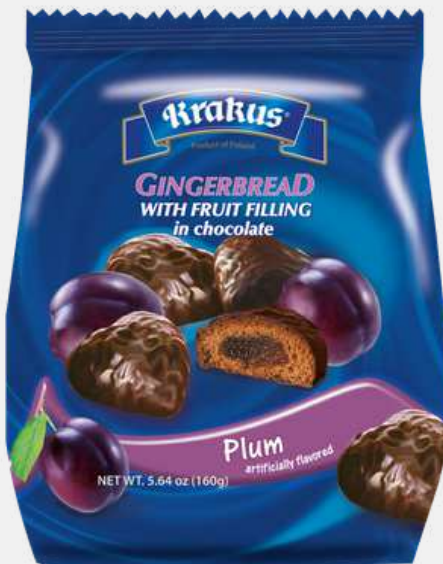
CHOCOLATE COVERED GINGERBREAD WITH PLUM-FILLING PIERNICZKI ŚLIWKOWE W CZEKOLADZIE 5.64 oz | 160 g | 12 units UPC# 820213129189