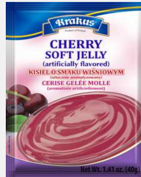
CHERRY SOFT JELLY KISIEL O SMAKU WIŚNIOWYM 1.41 oz l 40 g l 30 units UPC# 820213068785