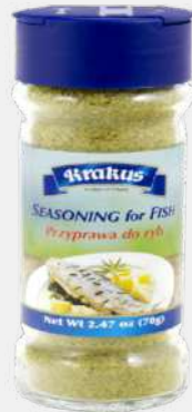
SEASONING FOR FISH PRZYPRAWA DO RYB 2.47 oz | 70 g | 6 units UPC# 820213136460