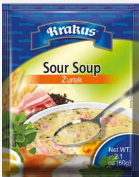
SOUR RYE SOUP ŻUREK W PROSZKU 2.11 oz | 60 g | 25 units UPC# 820213137023