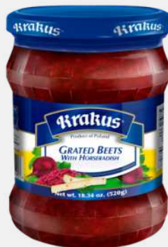
GRATED BEETS WITH HORSE RADISH BURACZKI ĆWIKŁOWE Z CHRZANEM 18.34 oz | 520 g | 6 units UPC# 820213100508