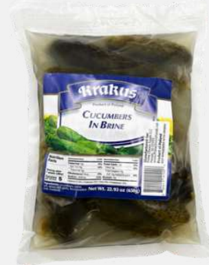
CUCUMBERS IN BRINE (BAG) OGÓRKI KISZONE 22.92 oz | 650 g | 18 units UPC# 820213141006