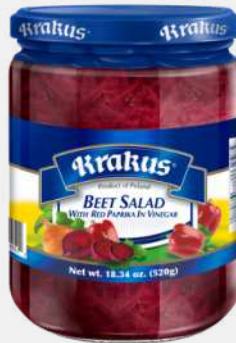
BEET SALAD WITH PAPRIKA SAŁATKA Z BURAKÓW Z PAPRYKĄ 18.34 oz | 520 g | 6 units UPC# 820213100522