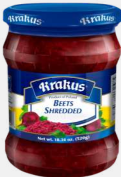
BEETS SHREDDED BURACZKI WIÓRKI 18.34 oz | 520 g | 6 units UPC# 820213100546