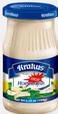
HOT HORSE RADISH CHRZAN OSTRY 6.35 oz l 180 g l 12 units UPC# 820213100805