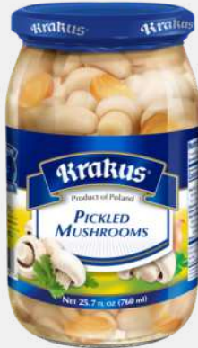
PICKLED MUSHROOMS PIECZARKI MARYNOWANE 25.7 fl oz | 760 ml | 12 units UPC# 820213101970