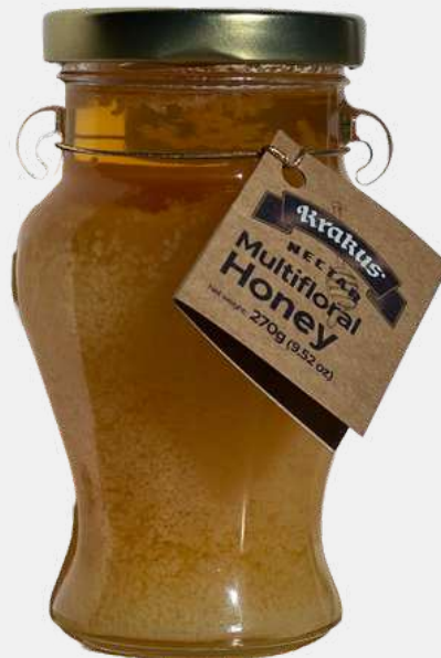
MULTIFLORAL HONEY NECTAR MIOD NEKTAROWY WIELOKWIATOWY 9.52 oz | 270 g | 6 units UPC# 820213133704