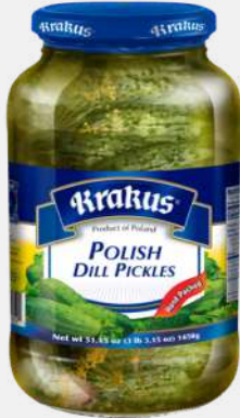
POLISH DILL PICKLES OGÓRKI KONSERWOWE 51 fl oz | 1.5 L | 6 units UPC# 820213101635