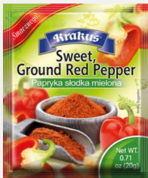
SWEET GROUND PEPPER PAPRYKA SŁODKA MIELONA 0.71 oz l 20 g l 28 units UPC# 820213137160