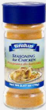
SEASONING FOR CHICKEN PRZYPRAWA DO KURCZAKA 2.47 oz | 70 g | 6 units UPC# 820213136507