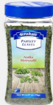
PARSLEY LEAVES NATKA PIETRUSZKI 2.47 oz | 270 g | 6 units UPC# 820213136545