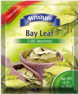
BAY LEAF LIŚĆ LAUROWY 0.21 oz | 6 g | 26 units UPC# 820213137122