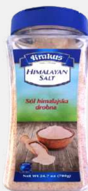
HIMALAYAN SALT SÓL HIMALAJSKA 24.7 oz | 700 g | 6 units UPC# 820213136682