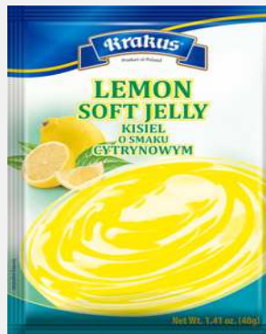
LEMON SOFT JELLY KISIEL O SMAKU CYTRYNOWYM 1.41 oz l 40 g l 30 units UPC# 820213068822