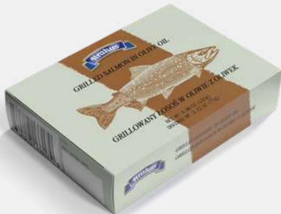
GRILLED SALMON IN OLIVE OIL GRILLOWANY ŁOSOŚ W OLIWIE Z OLIVEK 3.88 oz l 110 g l 10 units UPC# 820213133179