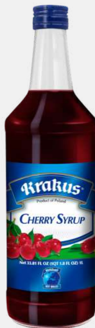
CHERRY SYRUP SYROP WIŚNIOWY 33.8 fl oz | 1 L | 6 units UPC# 820213101871