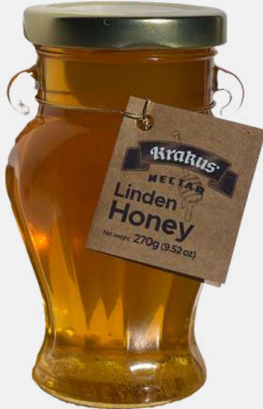
LINDEN HONEY NECTAR MIOD NEKTAROWY LIPOWY 9.52 oz | 270 g | 6 units UPC# 820213133667