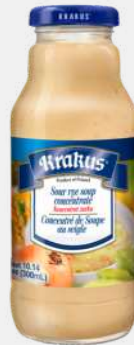
SOUR RYE SOUP CONCENTRATE KONCENTRAT ŻURKU 10.14 fl oz | 300 ml | 6 units UPC# 820213001805