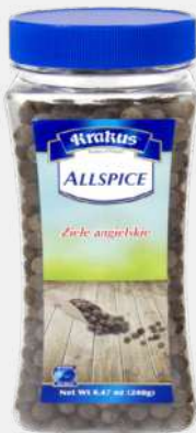
ALLSPICE ZIELE ANGIELSKIE 8.47 oz | 240 g | 6 units UPC# 820213136026