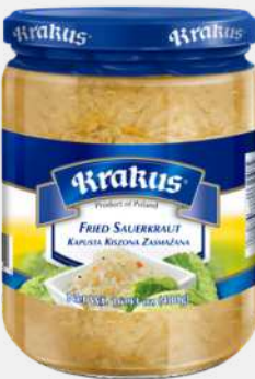
FRIED SAUERKRAUT KAPUSTA KISZONA ZASMAŻANA 16.93 oz | 480 g | 12 units UPC# 820213100904