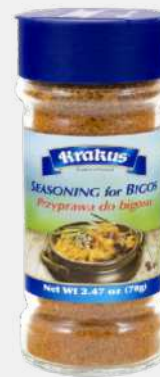
SEASONING FOR BIGOS PRZYPRAWA DO BIGOSU 2.47 oz | 70 g | 6 units UPC# 820213136446