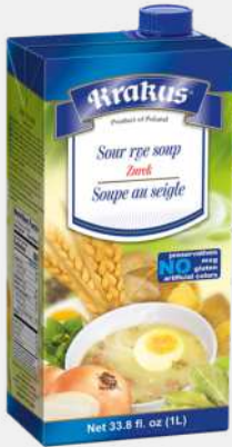
SOUR RYE SOUP ZUPA ŻUREK 33.8 fl oz | 1 L | 8 units UPC# 820213002000