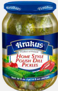
HOME STYLE DILL PICKLES OGÓRKI KONSERWOWE DOMOWE 30 fl oz | 887 ml | 12 units UPC# 820213123224