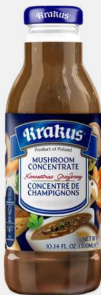
MUSHROOM CONCENTRATE KONCENTRAT GRZYBOWY 10.14 fl oz | 300 g | 12 units UPC# 820213002062