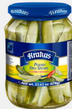
POLISH DILL SPEARS OGÓRKI CWIARTKI 23.63 oz | 670 g | 12 units UPC# 820213145004