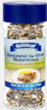
SEASONING FOR STEAK TRADITIONAL PRZYPRAWA DO STEKÓW TRADYCYJNA 2.47 oz | 70 g | 6 units UPC# 820213136125