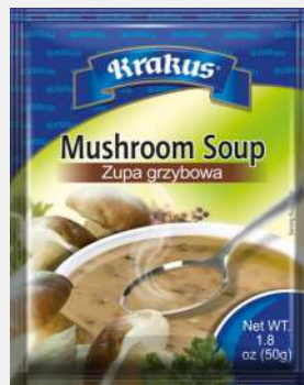
MUSHROOM SOUP ZUPA GRZYBOWA W PROSZKU 1.8 oz | 50 g | 25 units UPC# 820213137047