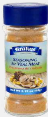
SEASONING FOR VEAL MEAT PRZYPRAWA DO CIEŁĘCINY 2.12 oz | 60 g | 6 units UPC# 820213136323