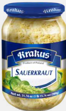
SAUERKRAUT KAPUSTA KISZONA 31.74 oz | 900 g | 12 units UPC# 820213101437