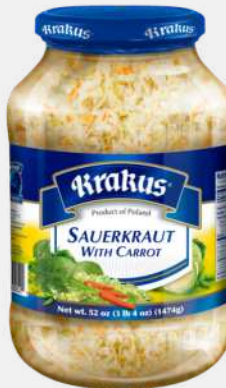
SAUERKRAUT WITH CARROT KAPUSTA KISZONA Z MARCHEWKA 52 oz | 1.47 kg | 6 units UPC# 820213101932