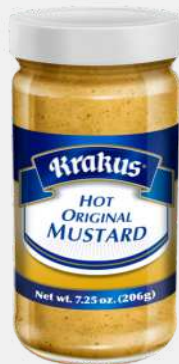
HOT ORIGINAL MUSTARD MUSZTARDA OSTRA 7.25 oz l 206 g l 12 units UPC# 820213101536