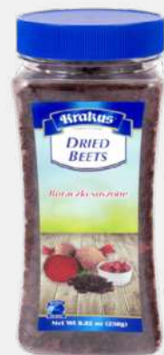
DRIED BEETS BURACZKI SUSZONE 8.82 oz | 250 g | 6 units UPC# 8202131360882