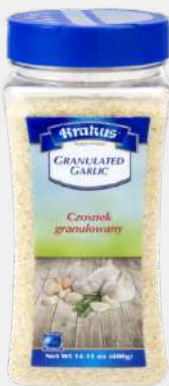
GRANULATED GARLIC CZOSNEK GRANULOWANY 14.11 oz | 400 g | 6 units UPC# 820213136606