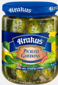
PICKLED GHERKINS OGÓRKI KORNISZONY 17.64 oz | 500 g | 6 units UPC# 820213145042