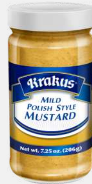
MILD POLISH STYLE MUSTARD MUSZTARDA ŁAGODNA 7.25 oz l 206 g l 12 units UPC# 820213101550