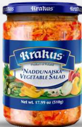
'NADDUNAJSKA' VEGETABLE SALAD SAŁATKA 'NADDUNAJSKA' 17.99 oz | 510 g | 8 units UPC# 820213124764