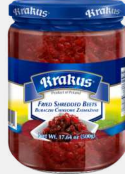
FRIED SHREDDED BEETS BURACZKI ĆWIKŁOWE ZASMAŻANAE 17.64 oz | 500 g | 12 units UPC# 820213100867