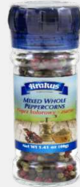
MIXED WHOLE PEPPERCORNS KOLOROWY PIEPRZ W ZIARNACH 1.41 oz | 40 g | 6 units UPC# 820213136224