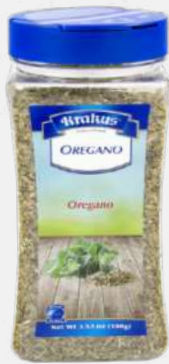
OREGANO OREGANO 3.53 oz | 100 g | 6 units UPC# 820213136644