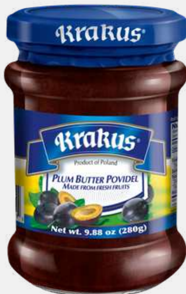
PLUM BUTTER POVIDEL POWIDŁA ŚLIWKOWE 9.88 oz l 280 g l 6 units UPC# 820213101772