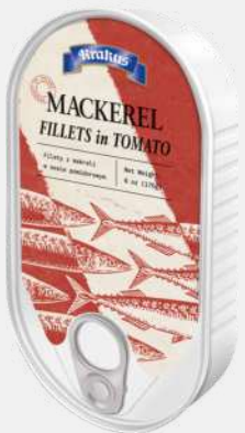
MACKEREL FILLETS IN TOMATO FILETY Z MAKRELI W SOSIE POMIDOROWYM 6 oz l 170 g l 10 units UPC# 820213133315