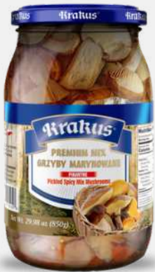
SPICY MIX MUSHROOMS PIKANTNA MIESZANKA GRZYBÓW 29.98 oz | 850 g | 6 units UPC# 820213131748