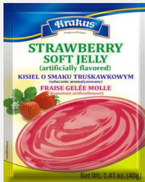
STRAWBERRY SOFT JELLY KISIEL O SMAKU TRUSKAWKOWYM 1.41 oz l 40 g l 30 units UPC# 820213068808