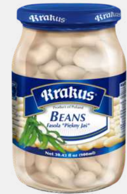
WHITE BEANS FASOLA „PIĘKNY JAS” 30.43 fl oz | 900 ml | 12 units UPC# 820213128540