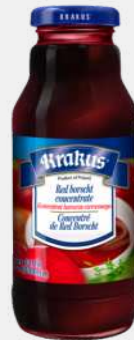
RED BORSCHT CONCENTRATE BARSZCZ CZERWONY KONCENTRAT 10.14 fl oz | 300 ml | 12 units UPC# 820213101154