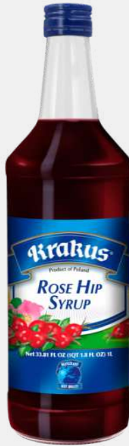
ROSE HIP SYRUP SYROP Z DZIKIEJ RÓŻY 33.8 fl oz | 1 L | 6 units UPC# 820213100966