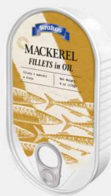
MACKEREL FILLETS IN OIL FILETY Z MAKRELI W OLEJU 6 oz l 170 g l 10 units UPC# 820213133308