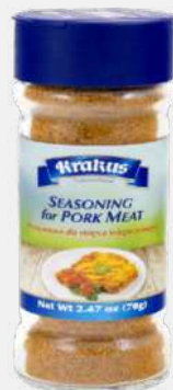
SEASONING FOR PORK MEAT PRZYPRAWA DO MIĘSA WIEPRZOWEGO 2.47 oz | 70 g | 6 units UPC# 820213136361