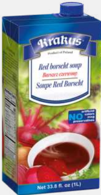
RED BORSCHT SOUP ZUPA BARSZCZ CZERWONY 33.8 fl oz | 1 L | 8 units UPC# 820213001980