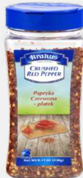
CRUSHED RED PEPPER PAPRYKA CZERWONA - PŁATEK 8.11 oz | 230 g | 6 units UPC# 820213136521