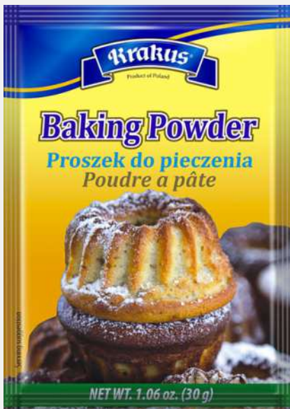
BAKING POWDER PROSZEK DO PIECZENIA 1.06 oz l 30 g l 35 units UPC# 820213068686