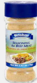
SEASONING FOR BEEF MEAT PRZYPRAWA DO MIĘSA WOŁOWEGO 2.47 oz | 70 g | 6 units UPC# 820213136248