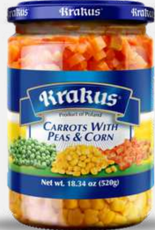
CARROTS WITH PEAS & CARROTS MARCH. Z GROSZKIEM I KUKURYDZA 18.34 oz | 520 g | 8 units UPC# 820213124726