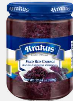
FRIED RED CABBAGE KAPUSTA CZERWONA ZASMAŻANA 17.64 oz | 500 g | 12 units UPC# 820213100881