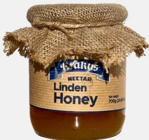
LINDEN HONEY NECTAR MIOD NEKTAROWY LIPOWY 24.7 oz | 700 g | 6 units UPC# 820213133681