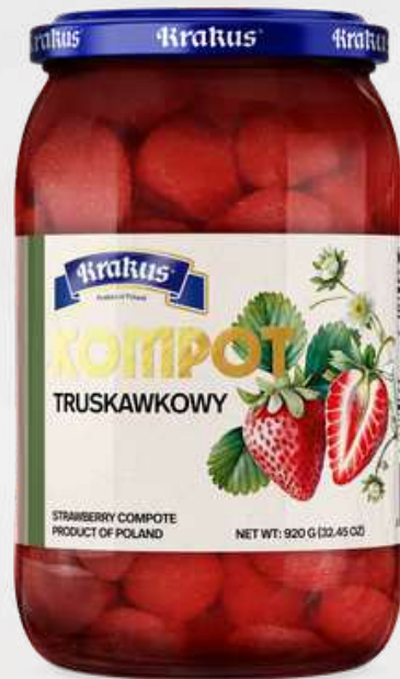
STRAWBERRY COMPOTE KOMPOT TRUSKAWKOWY 32.45 oz l 920 g l 6 units UPC# 820213124535