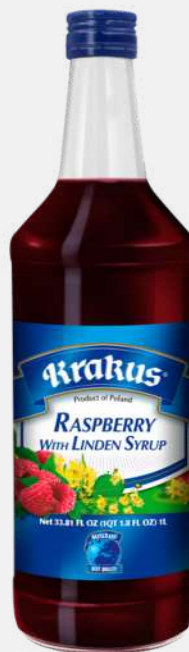
RASPBERRY & LINDEN SYRUP SYROP MALINA-LIPA 33.8 fl oz | 1 L | 6 units UPC# 820213123521