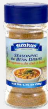
SEASONING FOR BEAN DISHES PRZYPRAWA DO DAŃ Z FASOLI 1.76 oz | 50 g | 6 units UPC# 820213136385