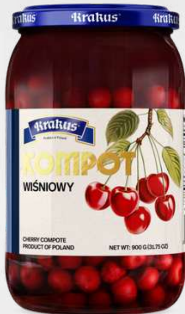
CHERRY COMPOTE KOMPOT WIŚNIOWY 31.75 oz l 900 g l 6 units UPC# 820213124528