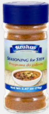
SEASONING FOR STEW PRZYPRAWA DO GULASZU 2.47 oz | 70 g | 6 units UPC# 820213136484