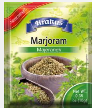
MARJORAM MAJERANEK 0.35 oz l 10 g l 20 units UPC# 820213137146