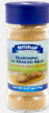
SEASONING FOR MINCED MEAT PRZYPRAWA DO MIĘSA MIELONEGO 2.47 oz | 70 g | 6 units UPC# 820213136347