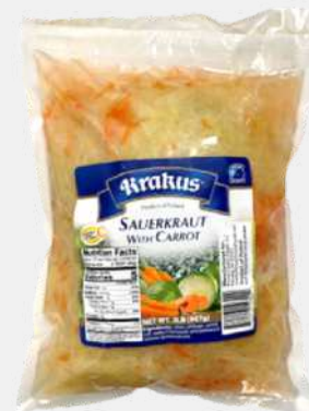
SAUERKRAUT WITH CARROT (BAG) KAPUSTA KISZONA Z MARCHEWKA 31.99 oz | 907 g | 10 units UPC# 820213123422