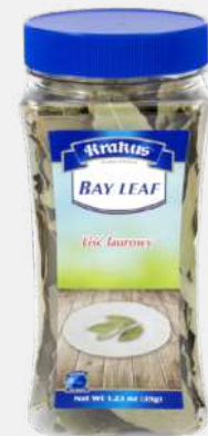
BAY LEAF LIŚĆ LAUROWY 1.23 oz | 35 g | 6 units UPC# 820213136064