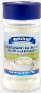
SEASONING FOR SOUR SOUP & BORSCH PRZYPRAWA DO ŻURKU I BARSZCZU 2.47 oz | 70 g | 6 units UPC# 8820213136262