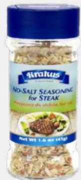
NO-SALT SEASONING FOR STEAK PRZYPRAWA DO STEKÓW BEZ SOLI 1.6 oz | 45 g | 6 units UPC# 820213136149