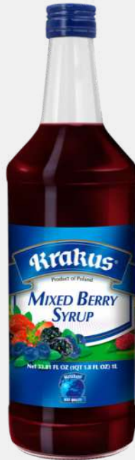
MIXED BERRY SYRUP SYROP LEŚNY 33.8 fl oz | 1 L | 6 units UPC# 820213101918