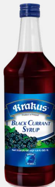
BLACKCURRANT SYRUP SYROP Z CZARNEJ PORZECZKI 33.8 fl oz | 1 L | 6 units UPC# 820213101277