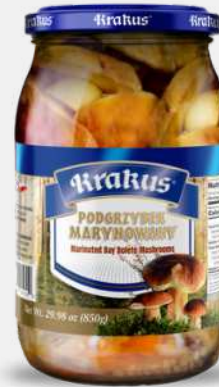
BAY BOLLETE MUSHROOMS PODGRZYBKII MARYNOWANE 29.98 oz | 850 g | 6 units UPC# 820213131700