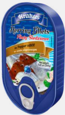
HERRING FILLETS IN PEPPER SAUCE ŚLEDZI W SOSIE PIEPRZOWYM 7.05 oz l 200 g l 10 units UPC# 820213133032