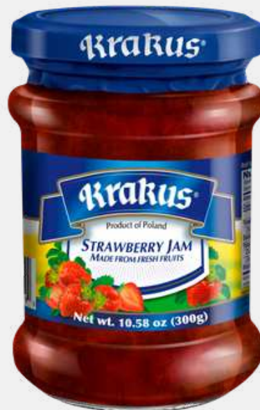
STRAWBERRY JAM DŻEM TRUSKAWKOWY 10.58 oz | 300 g | 6 units UPC# 820213101833