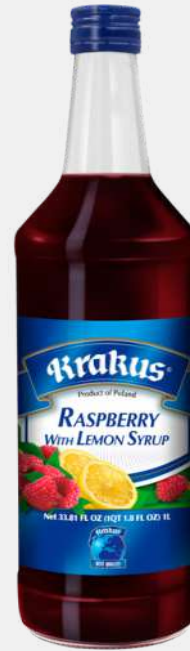
RASPBERRY & LEMON SYRUP SYROP MALIN-CYTRYNA 33.8 fl oz | 1 L | 6 units UPC# 820213123545