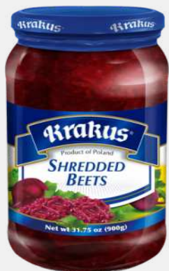
SHREDDED BEETS BURACZKI WIÓRKI 31.74 oz | 900 g | 12 units UPC# 820213125808