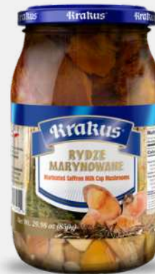
SAFFRON MILK CAP MUSHROOMS RYDZJE MARYNOWANE 39.98 oz | 850 g | 12 units UPC# 820213123224