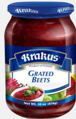
GRATED BEETS BURACZKI TARTE 30 oz | 850 g | 12 units UPC# 820213144007