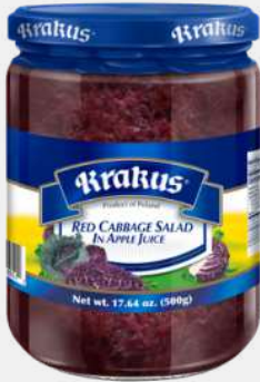
RED CABBAGE SALAD IN APPLE JUICE CZERWONA KAPUSTA Z JABŁKIEM 17.64 oz | 500 g | 6 units UPC# 820213100560