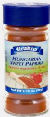
HUNGARIAN SWEET PAPRIKA SŁODKA WĘGIERSKA PAPRYKA 1.76 oz | 50 g | 6 units UPC# 820213136187