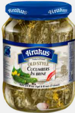
OLD STYLE CUCUMBERS IN BRINE STAROPOLSKIE OGÓRKI KWASZONE - MAŁOSOLNE 24 fl oz | 710 ml | 12 units UPC# 820213144076