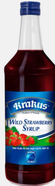
WILD STRAWBERRY SYRUP SYROP POZIOMKOWY 33.8 fl oz | 1 L | 6 units UPC# 820213100980