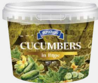
CUCUMBERS IN BRINE (BUCKET) OGÓRKI KISZONE 40.56 oz | 1.15 kg | 6 units UPC# 820213124566