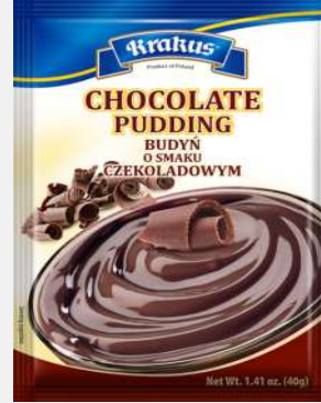
CHOCOLATE PUDDING BUDYŃ O SMAKU CZEKOLADOWYM 1.41 oz l 40 g l 30 units UPC# 820213068884