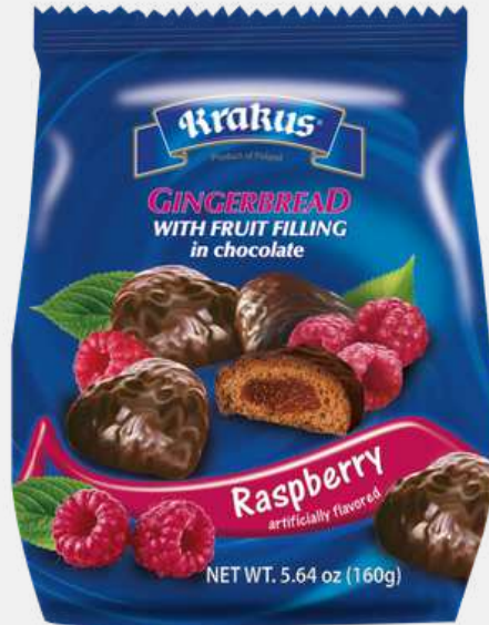
CHOCOLATE COVERED GINGERBREAD WITH RASPBERRY-FILLING PIERNICZKI MALINOWE W CZEKOLADZIE 5.64 oz | 160 g | 12 units UPC# 820213129349