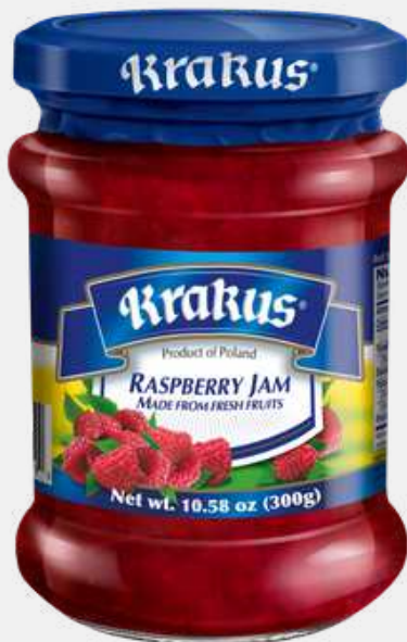
RASPBERRY JAM DŻEM MALINOWY 10.58 oz | 300 g | 6 units UPC# 820213101499