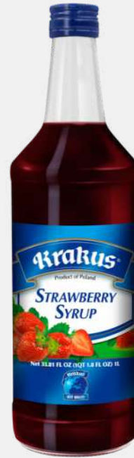
STRAWBERRY SYRUP SYROP TRUSKAWKOWY 33.8 fl oz | 1 L | 6 units UPC# 820213101819