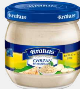
HORSERADISH CHRZAN TARTY BECZULKA