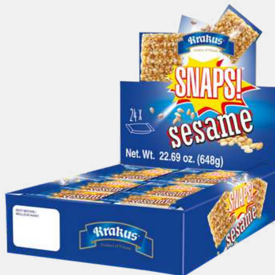
SESAME SNAPS SEZAMKI 0.95 oz | 27 g | 24 units UPC# 820213066996