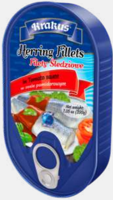
HERRING FILLETS IN TOMATO SAUCE ŚLEDZI W SOSIE POMIDOROWYM 7.05 oz l 200 g l 10 units UPC# 820213133001