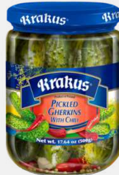
PICKLED GHERKINS WITH CHILI OGÓRKI KORNISZONY Z CHILI 17.64 oz | 500 g | 6 units UPC# 820213145066