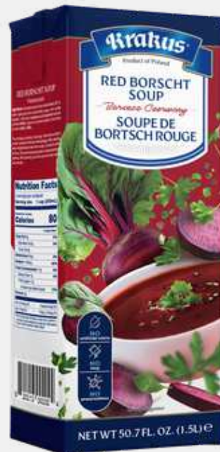
RED BORSCHT SOUP ZUPA BARSZCZ CZERWONY 50.7 fl oz | 1.5 L | 6 units UPC# 820213002024