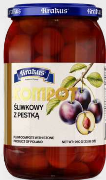
PLUM COMPOTE KOMPOT ŚLIWKOWY Z PESTKĄ 33.86 oz l 960 g l 6 units UPC# 820213124542