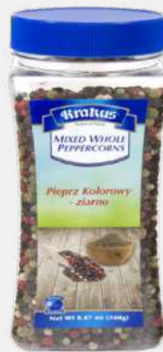
MIXED WHOLE PEPPERCORNS PIEPRZ KOLOROWY W ZIARNACH 8.47 oz | 240 g | 6 units UPC# 820213136620