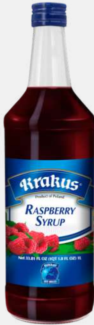
RASPBERRY SYRUP SYROP MALINOWY 33.8 fl oz | 1 L | 6 units UPC# 820213101512