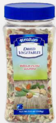
DRIED VEGETABLES WŁOSZCZYZNA SUSZONA 5.6 oz | 160 g | 6 units UPC# 820213136101