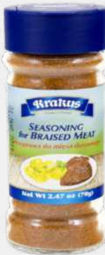
SEASONING FOR BRAISED MEAT PRZYPRAWA DO MIĘSA DUSZONEGO 2.47 oz | 70 g | 6 units UPC# 820213136309