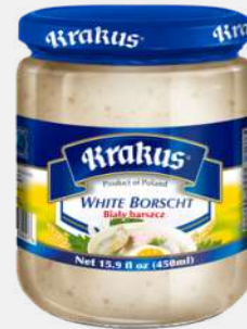
WHITE BORSCHT BIAŁY BARSZCZ 15.9 fl oz | 450 ml | 12 units UPC# 820213123248