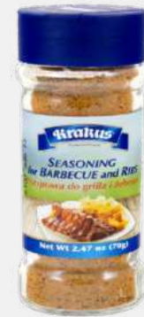
SEASONING FOR BARBECUE & RIBS PRZYPRAWA DO GRILLA I ZEBEREK 2.47 oz | 70 g | 6 units UPC# 820213136286