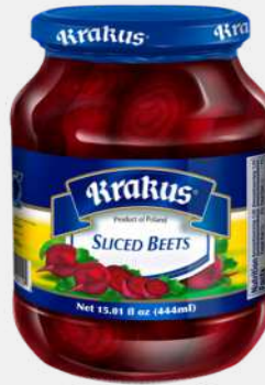
SLICED BEETS BURACZKI KONSERWOWE PLASTRY 15.01 fl oz | 444 ml | 12 units UPC# 820213101178