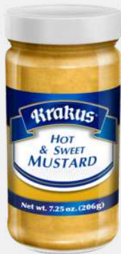
HOT & SWEET MUSTARD MUSZTARDA OSTRO-SŁODKA 7.25 oz l 206 g l 12 units UPC# 820213101574