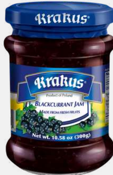
BLACKCURRANT JAM DŻEM Z CZARNEJ PORZECZKI 10.58 oz l 300 g l 6 units UPC# 820213101291