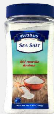
SEA SALT SÓL MORSKA 26.5 oz | 750 g | 6 units UPC# 820213136705