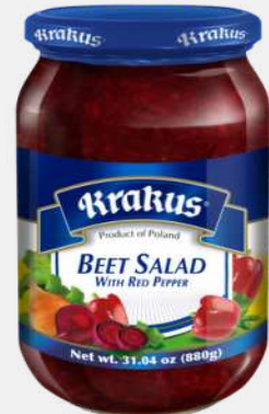
BEET SALAD WITH RED PEPPER SAŁATKA Z BURAKÓW Z PAPRYKĄ 31.04 oz | 880 g | 12 units UPC# 820213144045