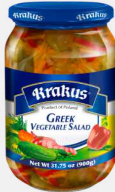
GREEK VEGETABLE SALAD GRECKA SAŁATKA WIELOWARZYWNA 31.75 oz | 900 g | 12 units UPC# 820213125006