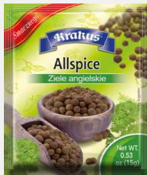
ALL SPICE ZIELE ANGIELSKIE 0.53 oz l 15 g l 20 units UPC# 820213137184