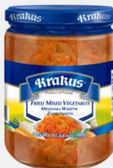
FRIED MIXED VEGETABLES MIESZANKA WARZYW ZASMAŻANYCH 17.64 oz | 500 g | 12 units UPC# 820213100843