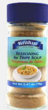
SEASONING FOR TRIPE SOUP PRZYPRAWA DO FLAKÓW 2.47 oz | 70 g | 6 units UPC# 820213136422