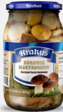
PORCINI MUSHROOMS BOROWIK MARYNOWANY 29.98 oz | 850 g | 6 units UPC# 820213131724