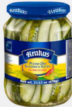
POLISH DILL SANDWICH SLICES OGÓRKI PŁASTRY 23.63 oz | 670 g | 12 units UPC# 820213145028