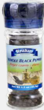
WHOLE BLACK PEPPER PIEPRZ CZARNY W ZIARNACH 1.5 oz | 42.5 g | 6 units UPC# 820213136200