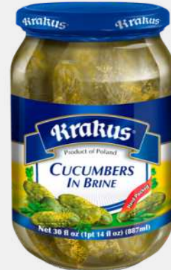
CUCUMBERS IN BRINE OGÓRKI KWASZONE 30 fl oz | 887 ml | 12 units UPC# 820213101599