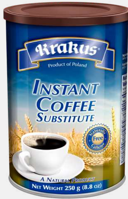
INSTANT COFFEE SUBSTITUTE TIN KAWA ZBOŻOWA - PUSZKA 8.8 oz l 250 g l 12 units UPC# 820213100201