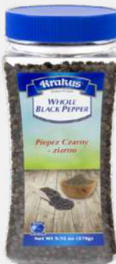
WHOLE BLACK PEPPER PIEPRZ CZARNY W ZIARNACH 9.52 oz | 270 g | 6 units UPC# 820213136583