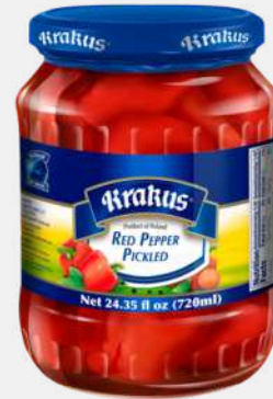
RED PEPPER PICKLED PAPRYKA KONSERWOWA 24.35 fl oz | 720 ml | 24 units UPC# 820213100645