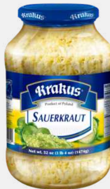
SAUERKRAUT KAPUSTA KISZONA 52 oz | 1.47 kg | 6 units UPC# 820213101451