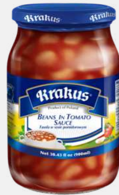
WHITE BEANS IN TOMATO SAUCE FASOLA „PIĘKNY JAS” W SOSIE POMIDOROWYM 30.43 fl oz | 900 ml | 12 units UPC# 820213128564