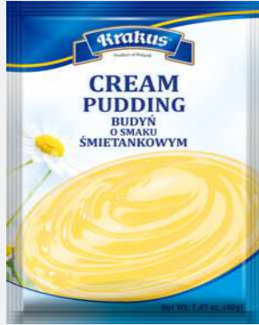
CREAM PUDDING BUDYŃ O SMAKU ŚMIETANKOWYM 1.41 oz l 40 g l 30 units UPC# 820213068860