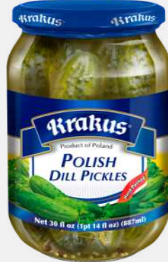
POLISH DILL PICKLES OGÓRKI KONSERWOWE 30 fl oz | 887 ml | 12 units UPC# 820213101673