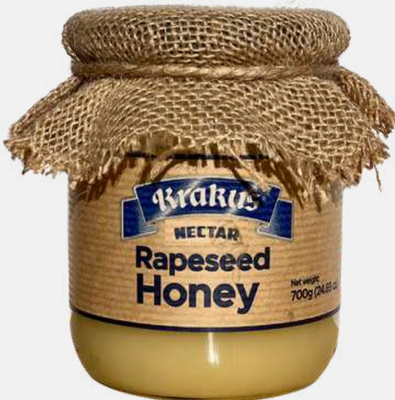
RAPESEED HONEY NECTAR MIOD NEKTAROWY RZEPAKOWY 24.7 oz | 700 g | 6 units UPC# 820213133728