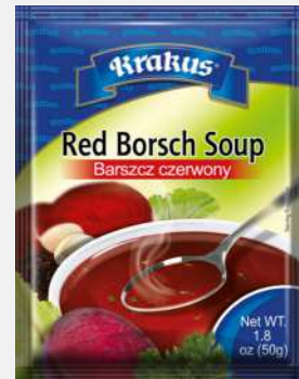
RED BORSCHT SOUP BARSZCZ CZERWONY W PROSZKU 1.76 oz | 50 g | 25 units UPC# 820213137009