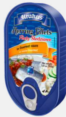
HERRING FILLETS IN GOURMET SAUCE ŚLEDZI W SOSIE GOURMET 7.05 oz l 200 g l 10 units UPC# 820213133094