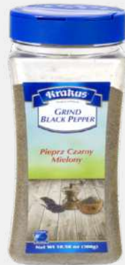
GRIND BLACK PEPPER PIEPRZ CZARNY MIELONY 10.58 oz | 300 g | 6 units UPC# 820213136569