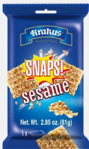
SESAME SNAPS 3-PACK SEZAMKI 3-PAK 2.85 oz | 81 g | 35 units UPC# 820213067009