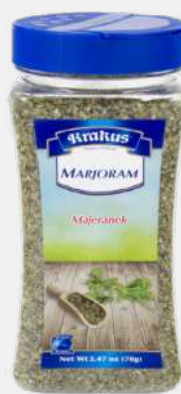
MARJORAM MAJERANEK 2.47 oz | 70 g | 6 units UPC# 820213136040