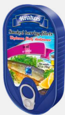
SMOKED HERRING FILLETS IN OIL WĘDZONE FILETY ŚLEDZIOWE W OLEJU 6.7 oz l 190 g l 10 units UPC# 820213133124