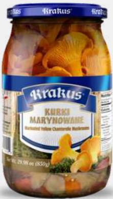
YELLOW CHANTERELLE MUSHROOMS KURKI MARYNOWANE 29.98 oz | 850 g | 6 units UPC# 820213131786