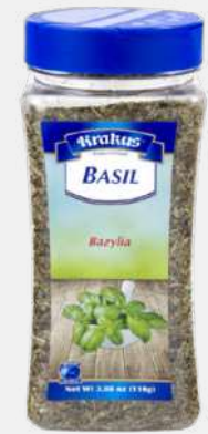
BASIL BAZYLIA 3.88 oz | 110 g | 6 units UPC# 820213136668