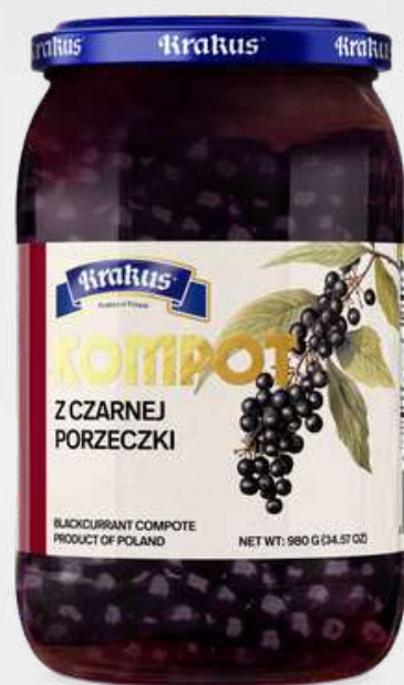
BLACKCURRANT COMPOTE KOMPOT Z CZARNEJ PORZECZKI 34.57 oz l 980 g l 6 units UPC# 820213124559